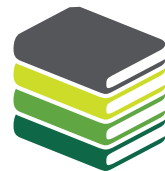
TUTORING & ACADEMIC SUPPORT