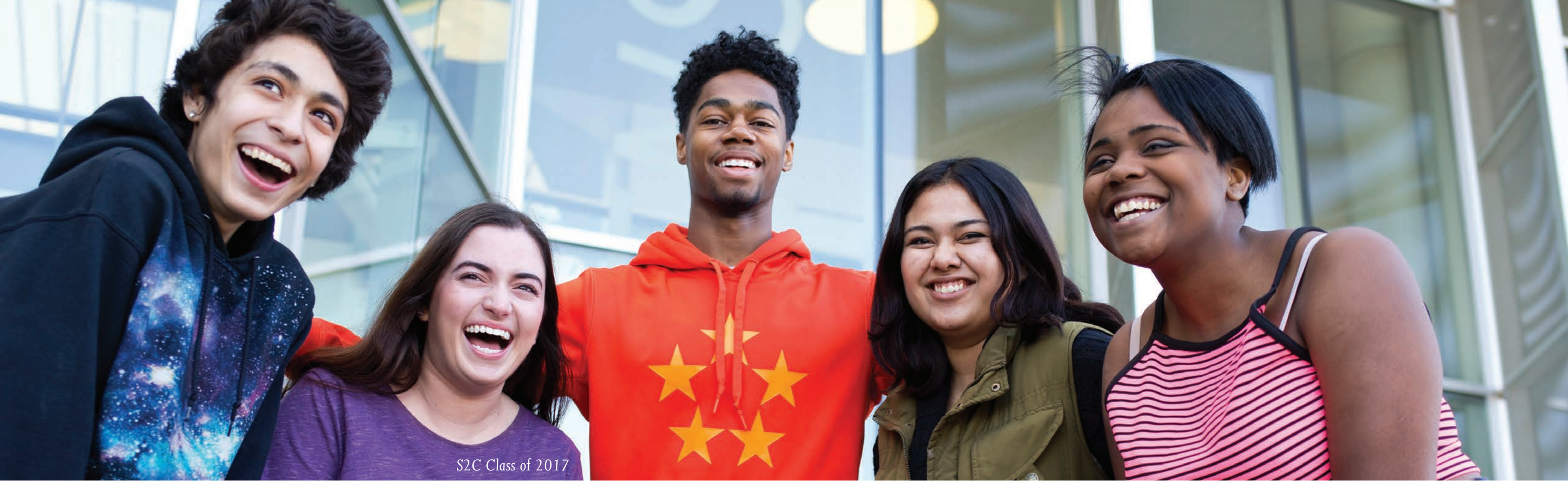
S2C Class of 2017

Stevenson to College (S2C) provides students with the mentoring, knowledge, and financial assistance they need to make it to and through college.