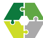
COLLEGE RESEARCH & APPLICATION ASSISTANCE